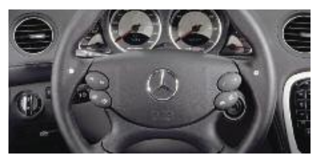
Controls on steering wheel

Some manual cars have automated gear systems which work without using a clutch pedal. You move a lever or use push buttons or paddles on the steering wheel to select a gear.