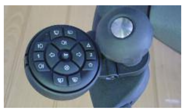
Steering knob combined with wireless secondary controls – Lodgesons

Prices vary widely depending on how complex the controls are and on the wiring system of the car (from £700). Check the cost of any adaptation before ordering it. Also check that it is compatible with your car. Your adaptation company will advise on this.