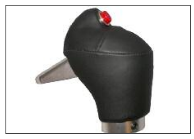
Gear stick mounted Duck clutch, from ELAP

If you can operate the gear stick, but not the clutch pedal, you can get an adapted clutch that you operate with the same hand you use to change gear (from £2,145). See our Car controls guide.