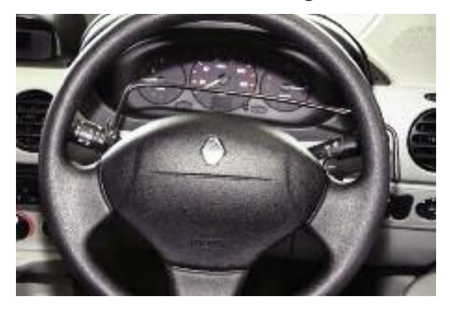
Indicators extension – Alfred Bekker

If you need to work the indicator with your right hand, you can have an extension fitted to the indicator stalk that takes it over the steering column.