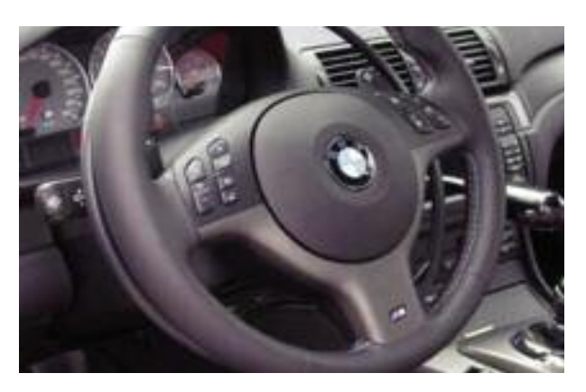
K5 under ring – Autoadapt