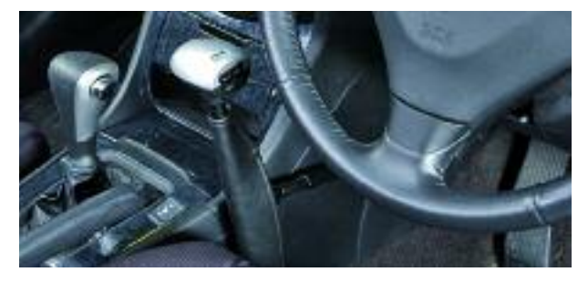
Floor-mounted Menox Carospeed – Autoadapt

clamp-on controls simply bolt on to the pedals (£350) – best as a short term option.