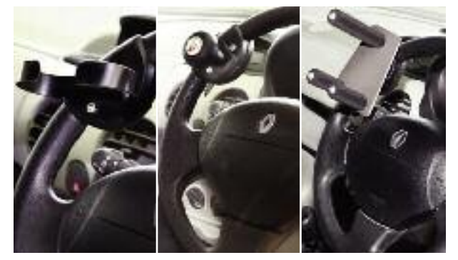
Steering wheel grips from Alfred Bekker

Spinners come in several shapes to suit different types of grip and most cost between £15 and £110.