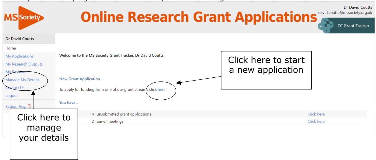
Figure 1 - Homepage

You can update this information by selecting 'Manage my details' on your homepage. You can also change your password or contact email address here. An example of what your homepage will look like is provided in Fig1.