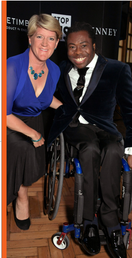
SMS Battles event, May 2019. Pictured: Clare Balding, Ade Adepitan

Volunteering means bringing your energy and enthusiasm to the streets, supporting our MS superstars - cheering, marshalling, and letting them know how much we appreciate their efforts.