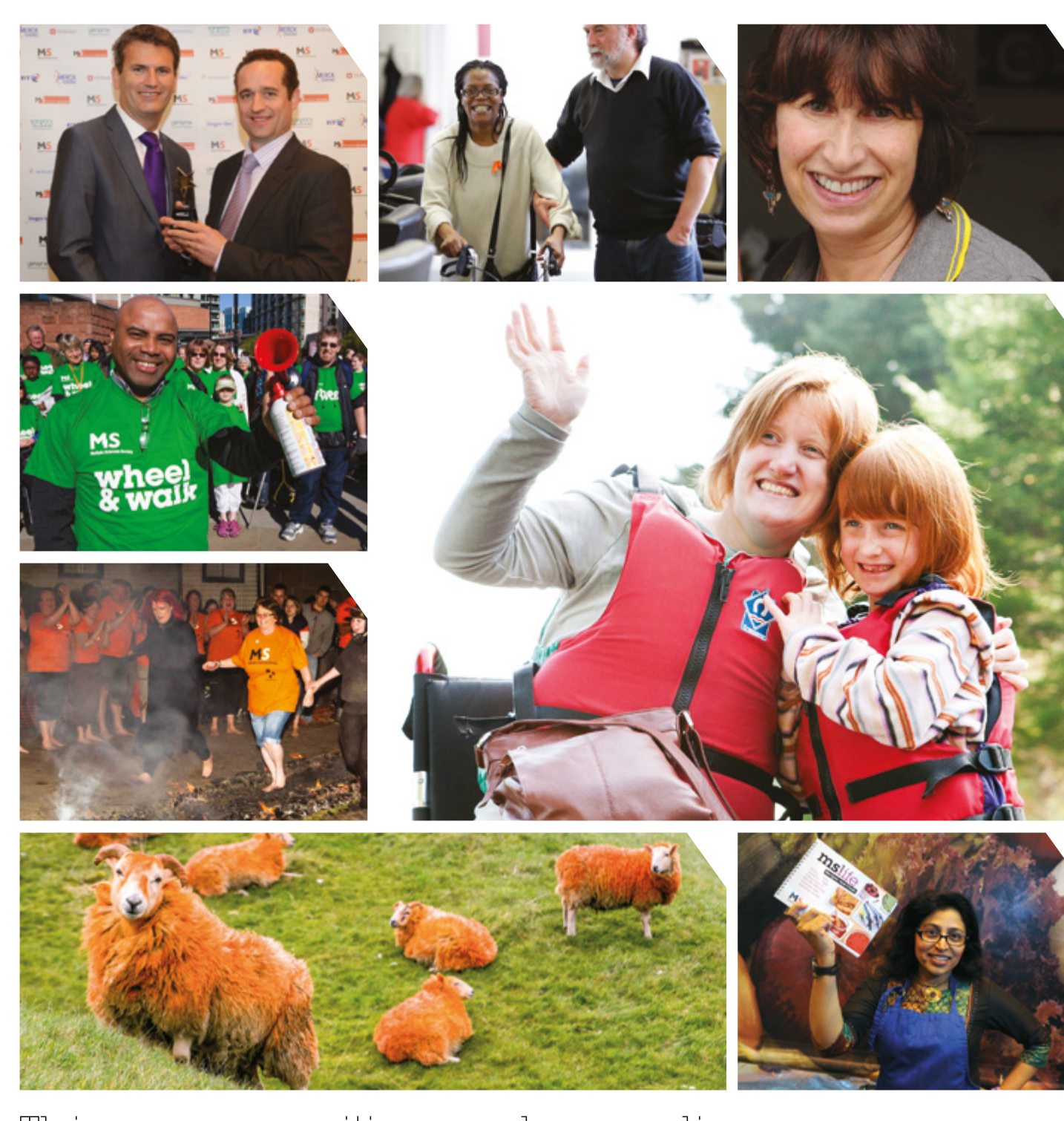
This was an exciting and rewarding year for the MS Society. Here we showcase some of the people and events that make up...